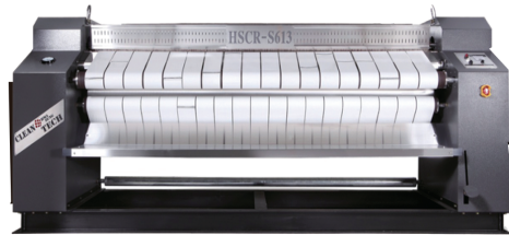
Flatwork Ironer series