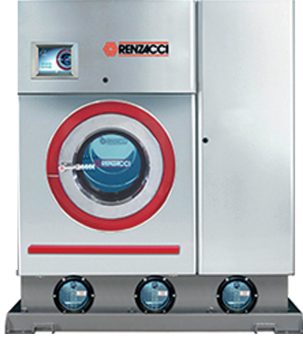
Dry cleaning Machine