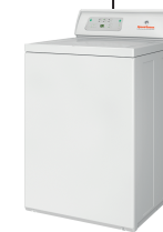
Washer extractor series